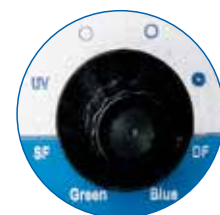
Turning knob for the filter disk