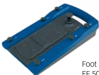
Foot switches EF 5000 and EF 5001 with 14 functions

HAAG-STREIT SURGICAL recommends its newly designed foot switches. While EF 5000 is connected to the floor stand via cable, EF 5001 controls 14 functions of the microscope wireless via Bluetooth.