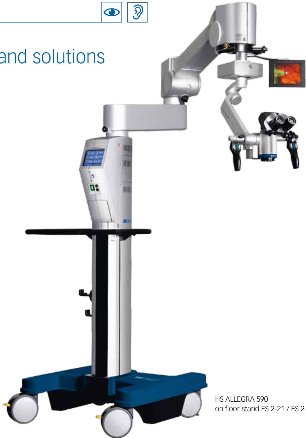
HS ALLEGRA 590 on floor stand FS 2-21 / FS 2-25