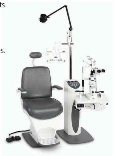
Reichert® Endurance™ Tilt Chair & Stand